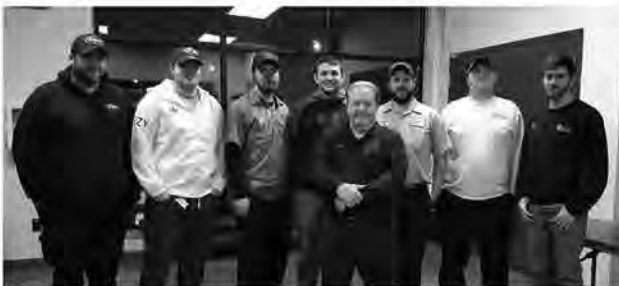
1 st year Students