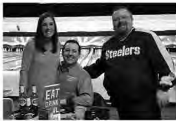
Shearer Htg / Carrier/Bryant Team