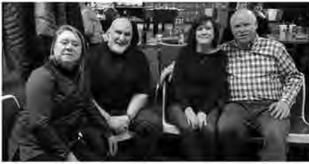
Valley Heating / Boehmer Htg