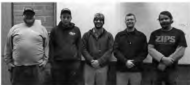
3 rd year Students